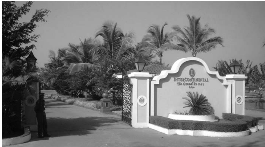
The InterContinental, Goa, India

InterContinental Hotels Group (IHG) is a global hotel company operating seven hotel brands – InterContinental, Crowne Plaza, Hotel Indigo, Holiday Inn, Holiday Inn Express, Staybridge Suites and Candlewood Suites. In 2010 it boasted more guest rooms than any other hotel company in the world with around 4400 hotels across nearly 100 countries. The goal of IHG is 'to create Great Hotels Guests Love' and its mission is 'to grow by making IHG brands the first choice for guests and hotel owners'.