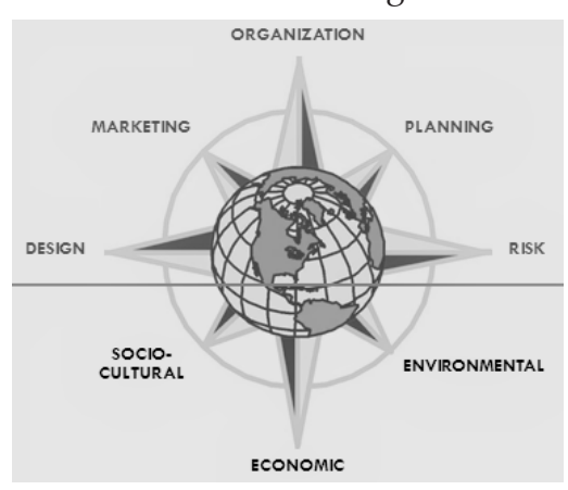
Figure 7.2: The Event Compass - Concept

Each of the three impact dimensions and five management functions can be broken down into many details - after all, a compass has 360 degrees! This model is simply a starting point for planners and evaluators within the organisation.