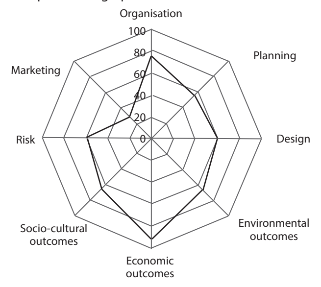
Figure 7.3: Sample Event Compass radar graph